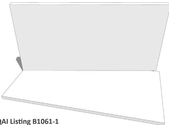
QAI Listing B1061-1

Envirosheet's exceptionally low, long term, in-service water absorption properties allow it to maintain its specified thermal performance and durability when installed for slab on grade or below grade applications.